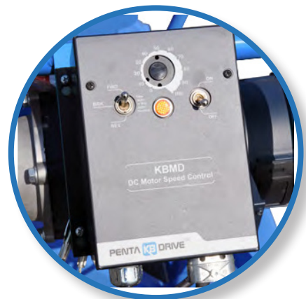
Variable Speed Drive