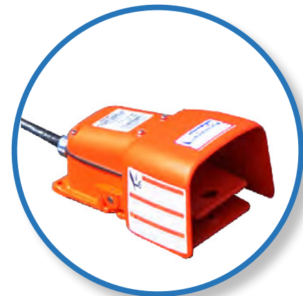
Operator Safety Foot Switch