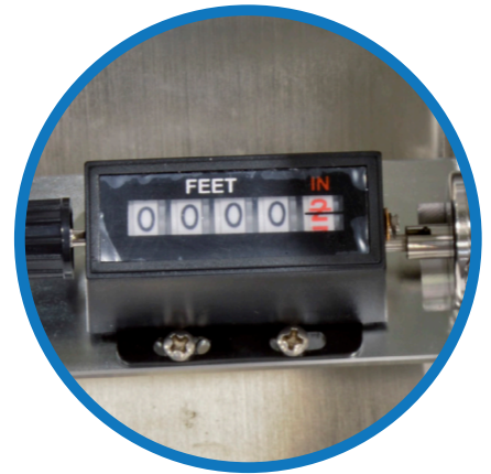
COUNTER AVAILABLE IN FEET & INCHES OR METERS & DECIMETERS