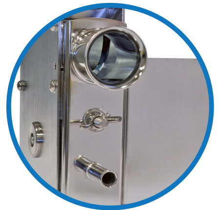
ADJUSTABLE LARGE & SMALL MATERIAL FAIRLEAD TUBE GUIDES