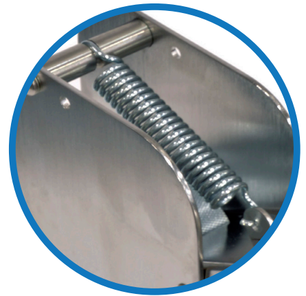
ADJUSTABLE TENSION SPRING SETTINGS