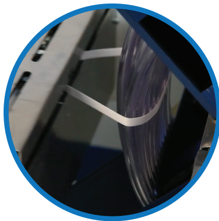
1 TO 4 BANDS