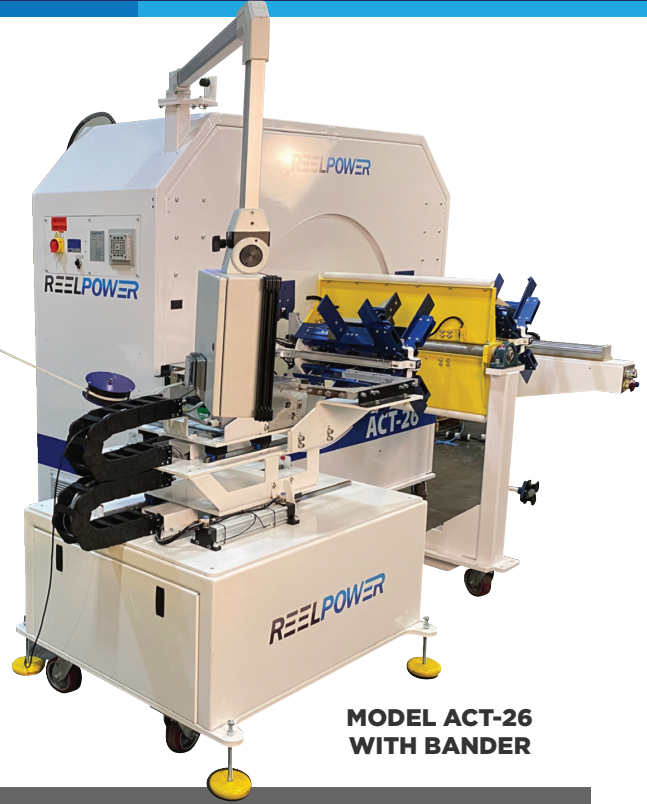
MODEL ACT-26 WITH BANDER