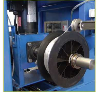
Plug-In Spool Shaft's or Collapsible Coilers