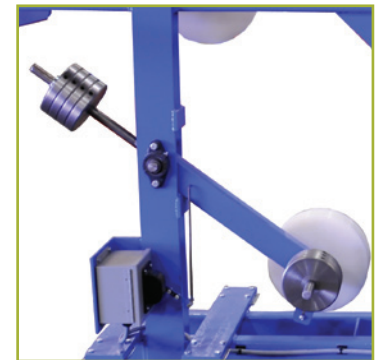
Counter Weight Tension Control