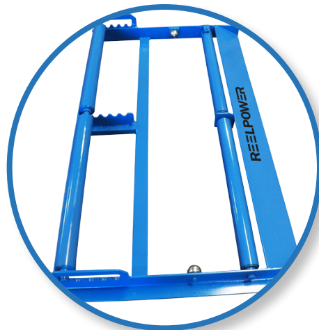
Model RRP-480DW HD