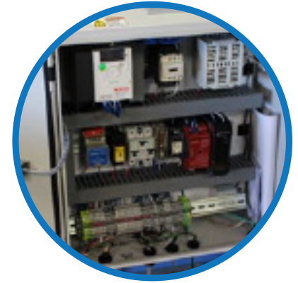
UL CERTIFIED PANEL BOX