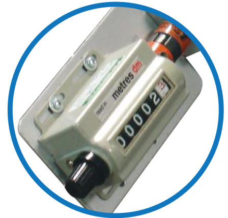
OPTIONAL METRIC COUNTER