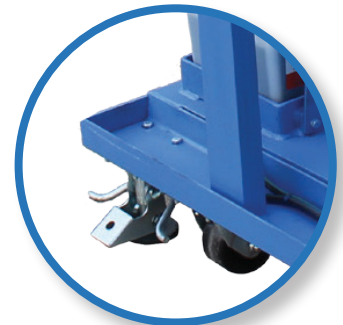
Heavy duty mobile frame with floor locks

Ideally suited for pulling material from reel racks, reel roller platforms, or a pay-out cart