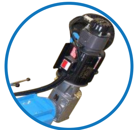
AC Vector Brakemotor