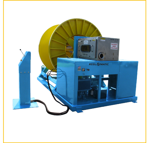
Model SP-CRS108 Powered Cable Reel Stand