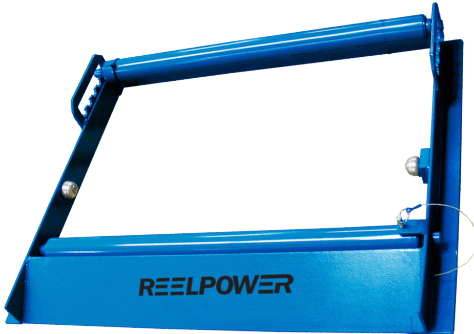
Model RRP300S-01 shown