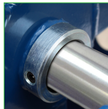
Standard 2 1/8" Locking Reel Collar