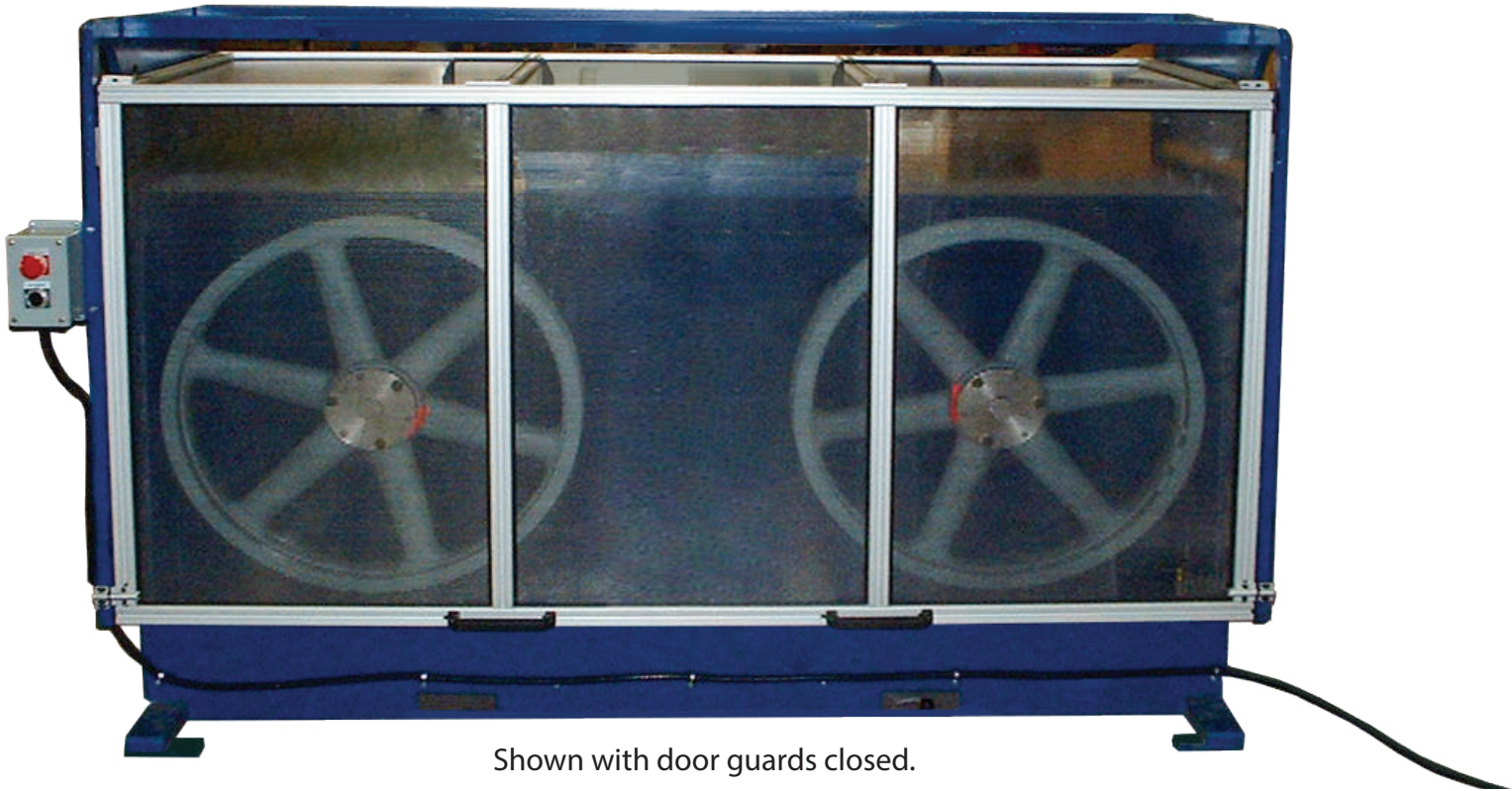
Shown with door guards closed.