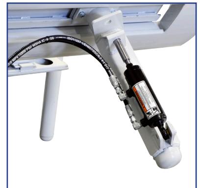
Pipe Connector Quick Release Option