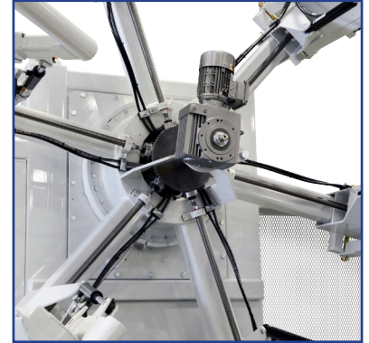
Powered Coil Wheel Expand/Collapse