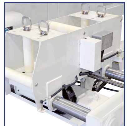
Adjustable Pipe Traverser Guide Rollers with Pipe Present Sensors