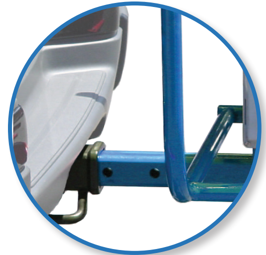
Standard and custom hitch mounts