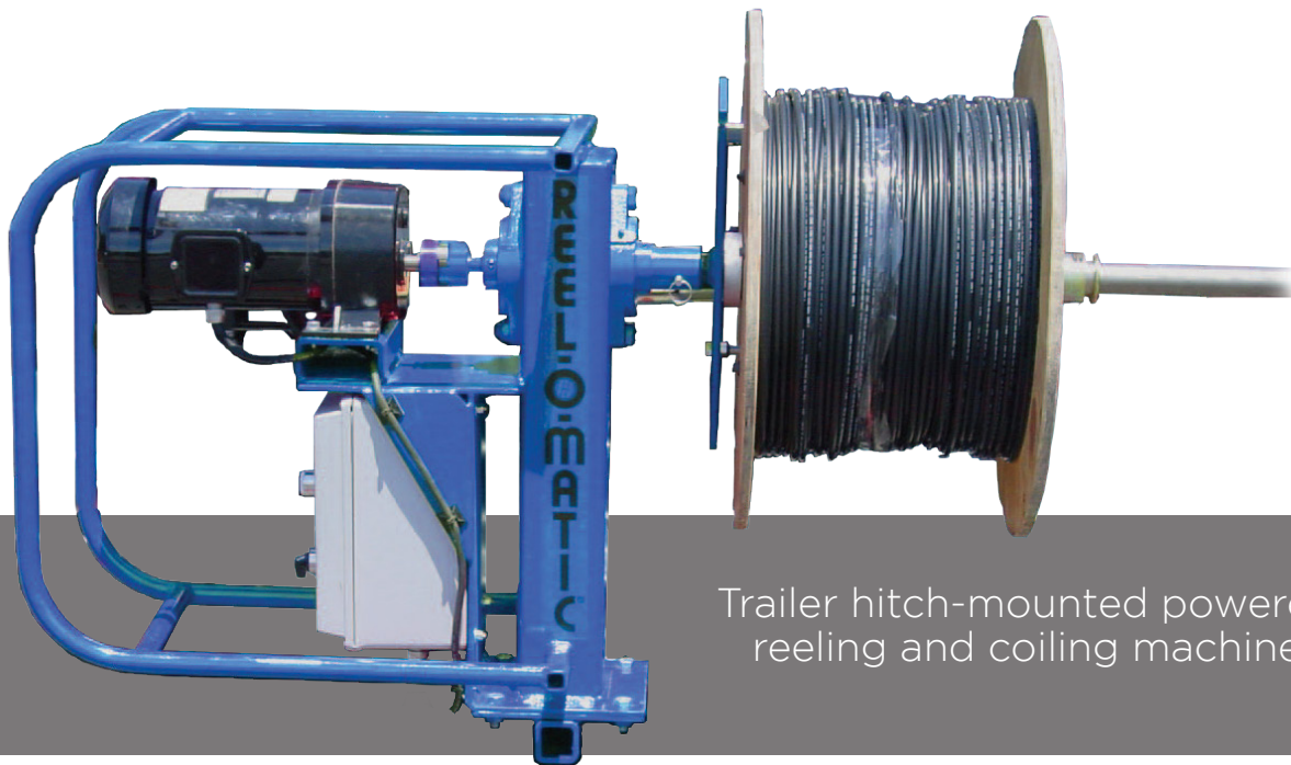
Trailer hitch-mounted powered reeling and coiling machine