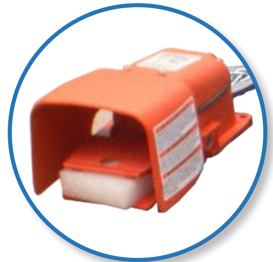
Operator safety foot switch