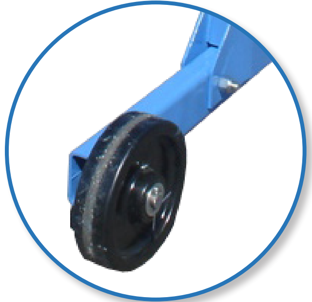
Heavy duty wheels