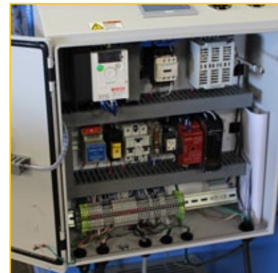
UL Certified Panel Box