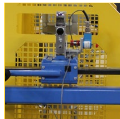
Automatic Levelwind System